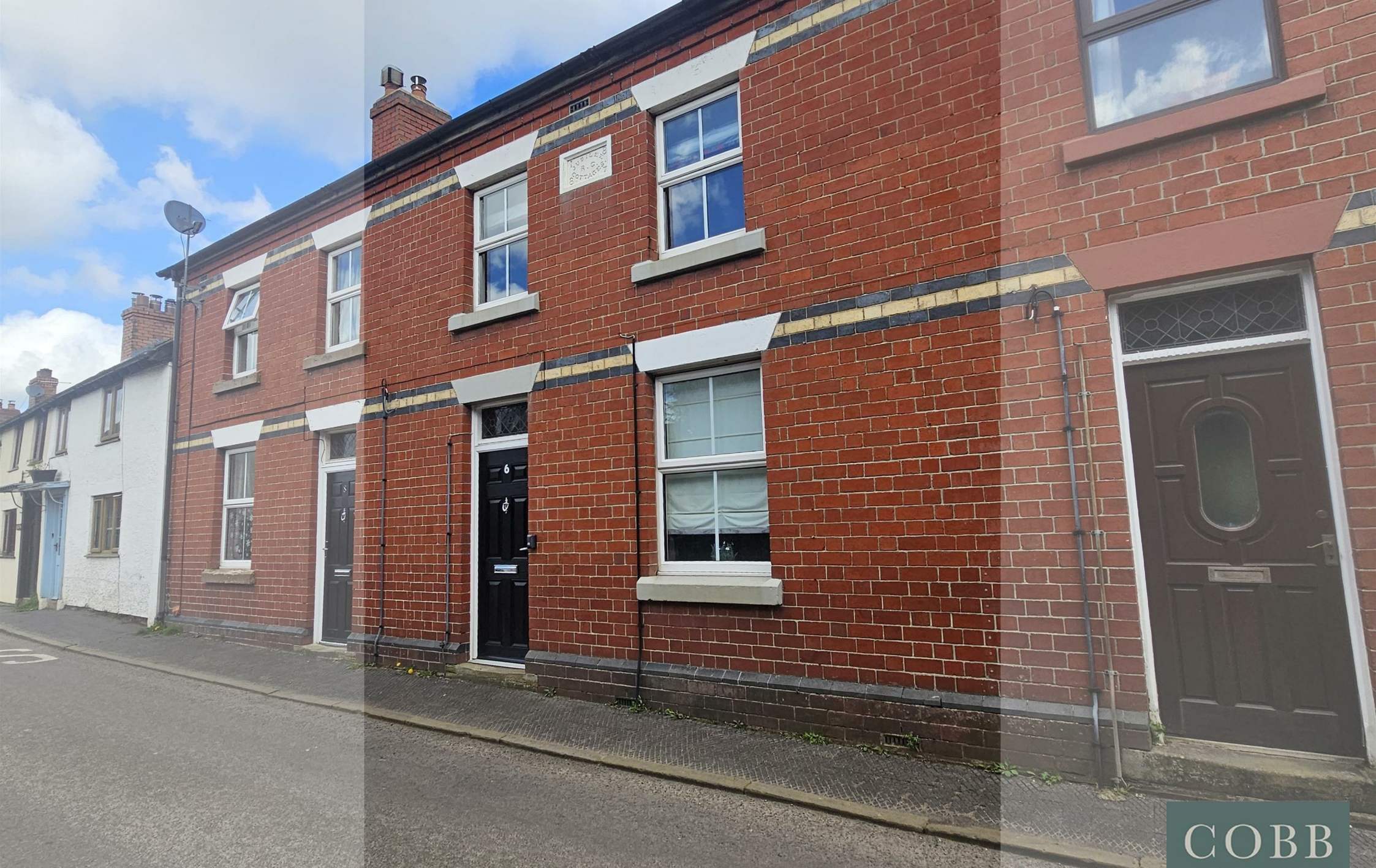
6, Castle Street, Clun, SY7 8JU Price £240,000